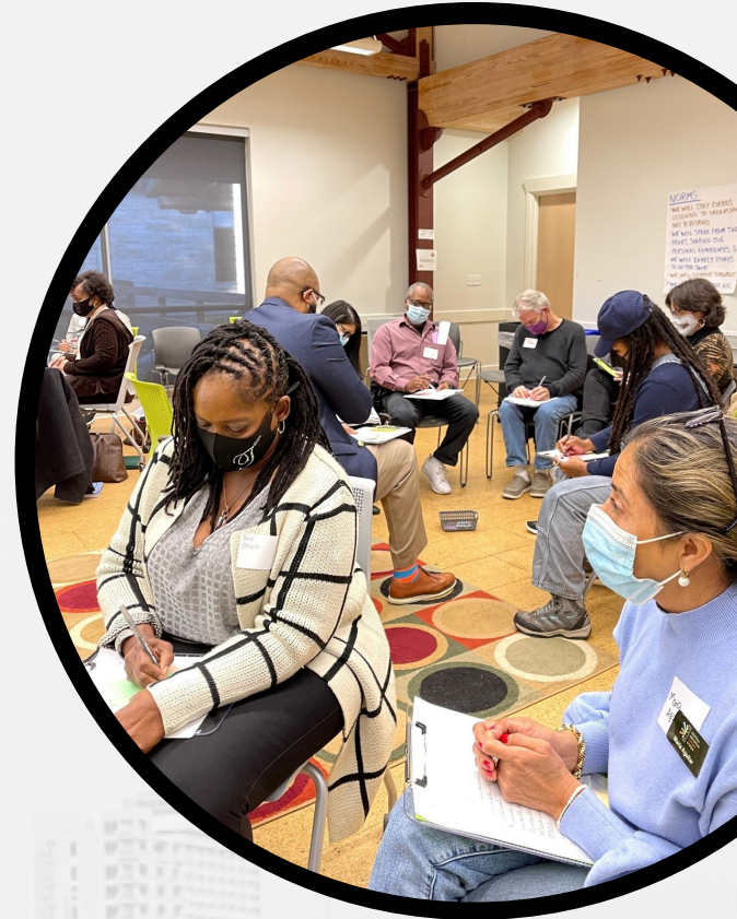
Residents and volunteer facilitators participate in small group dialogue in Ward 2.

Each Equity Lab opened with a brief introduction to the ODEI and our staff. Next, we invited participants to engage in Reflective Structured Dialogue around themes of belonging and identity. Said one participant, “I especially enjoyed the discussions we had...the participants gave honest responses that reflected their thinking.” After this opportunity to listen deeply and identify shared values, participants listed their top concerns related to diversity, equity, and inclusion in Little Rock and then prioritized them as a group. Next we invited participants to share their ideas for solutions, asking, If you were 10 times bolder, what big idea would you recommend to address these concerns? Finally, participants assigned scores to the ideas, ranking their top choices.