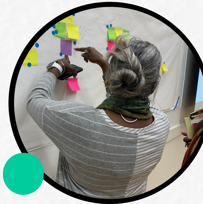
Participants from Ward 2 work together to prioritize equity-related concerns.

Participants expressed concern that we are not meeting the need for timely and effective communication between city government and residents, particularly as it relates to events, programs, and funding opportunities. Of special note was that the city's adult residents, approximately 6,000 of whom speak only Spanish (PolicyMap, 2019), have little to no access to basic public services and meetings.