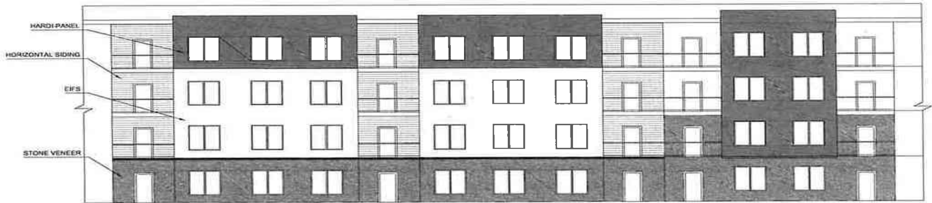
PARTIAL SIDE ELEVATION 4-STORY BUILDING ————— SCALE: 1/8" = 1'-0"