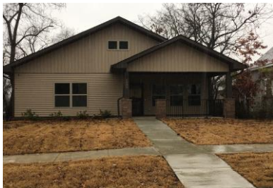
3502 Cobb Street – 3 BRs, 2 Baths, 2 Car Garage, For Sale - $128,500.