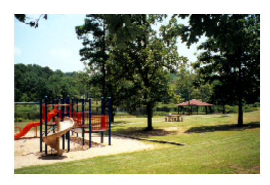
Community parks may contain both active and passive recreation areas