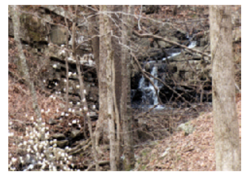
Open space and natural features at public parks

The Little Rock parks system consists of roughly 3200 acres of developed park parcels, and 2600 acres of currently undeveloped parcels and open space (see Chapter One for a complete inventory). These developed parks are the public's primary access to the overall open space system. In general, the western portions of Little Rock have significantly fewer public parks than the remainder of the city.