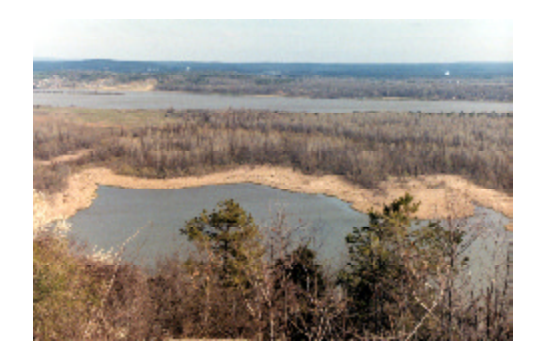
Two Rivers Park