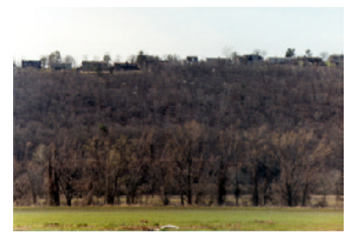
Steep slopes and floodplains