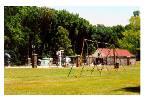
Neighborhood parks serve a smaller, more specific area

These parks are usually found in urban areas or on small urban lots in older neighborhoods. Because of mini-parks' limited service to the community, Little Rock should consider accepting no future parks under five acres in size, unless they are needed in heavily developed areas which have inadequate recreational provisions and no larger parcels can be obtained, or are located within the urban context of downtown. Pettaway, Fletcher, Cheatem, and Ninth Street parks are all considered mini-parks.