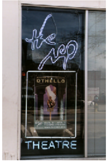
Arkansas Repertory Theater