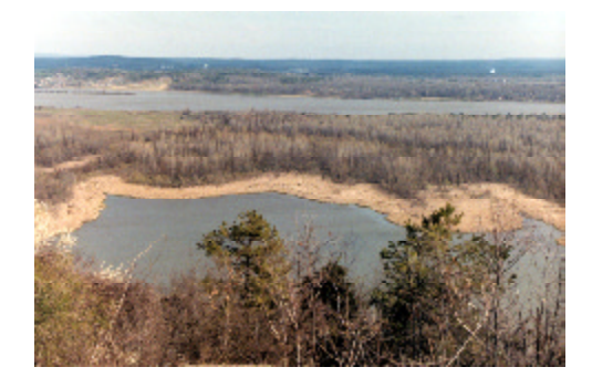
Regional parks such as Two Rivers showcase natural or specialized amenities

Regional parks should be accessible via automobile, foot, bicycle, and other means of transportation. Ideally, regional parks should be integrated as part of the larger open space system. In addition, regional parks should be located in areas with compatible adjacent land uses.