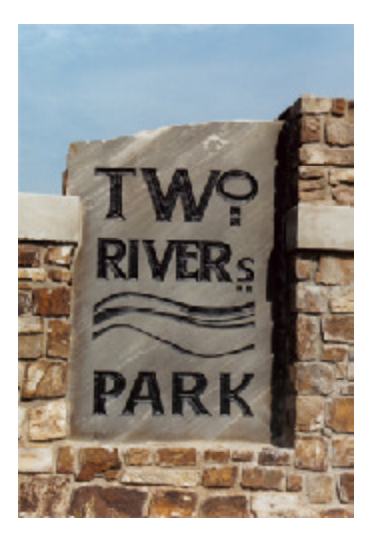
Two Rivers Park