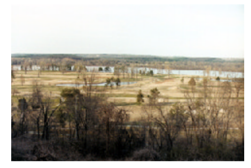
Rebsamen Park Golf Course