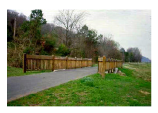
Trail along the Arkansas River