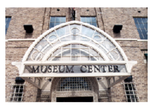
Museum of Discovery