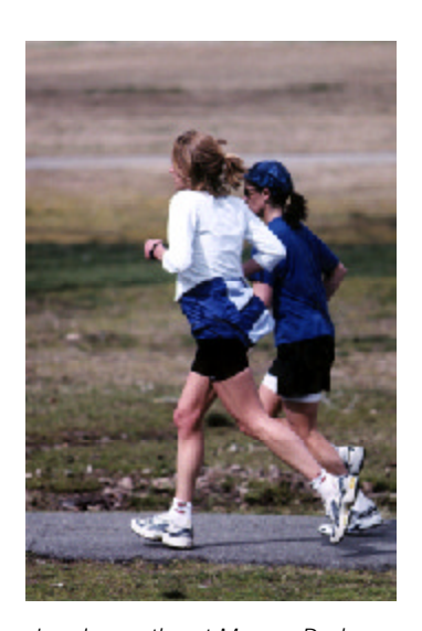
Jogging paths at Murray Park are among the most popular amenities within the park system.