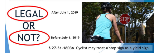
Figure 2. The Program allows us to share important messaging about AR Act 650, passed in April 2019.

Bike driver approaches a stop sign, scans for conflicts, and sees none. Bike driver proceeds through the intersection without coming to a complete stop.