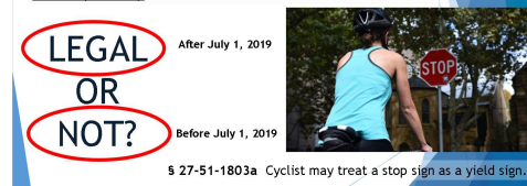
Figure 2. The Program allows us to share important messaging about AR Act 650, passed in April 2019.

Bike driver approaches a stop sign, scans for conflicts, and sees none. Bike driver proceeds through the intersection without coming to a complete stop.