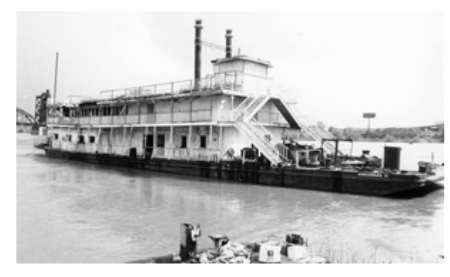
Arkansas II Riverboat (North Little Rock - Pulaski County)

South end of Locust Street on Arkansas River 1939-1940 Corps of Engineers snagboat Listed on 6/14/1990