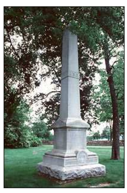
Little Rock Confederate Memorial

Little Rock National Cemetery 1913 commemorative monument Listed on 5/3/1996