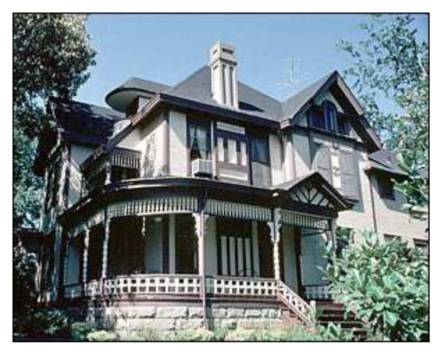
Albert Retan House 506 North Elm Street 1893 Queen Anne/Colonial Revival mix Listed on 12/3/1980