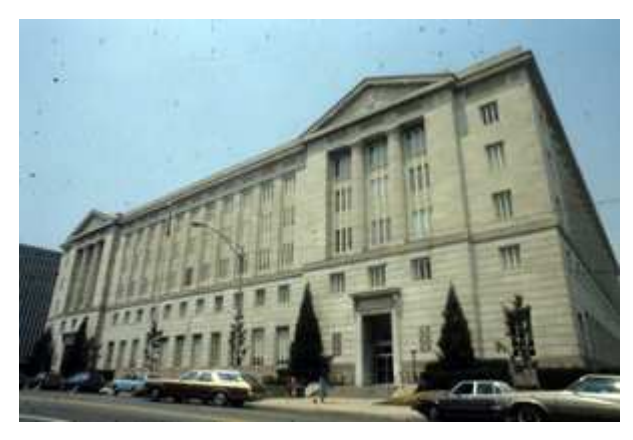
Little Rock U. S. Post Office and Courthouse

1861-1865 Civil War-era burial ground for Union soldiers Listed on 12/20/1996