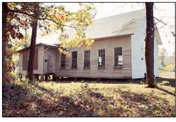
Walnut Grove Methodist Church

West of Little Rock on Walnut Grove Road ca. 1886 vernacular Greek Revival church