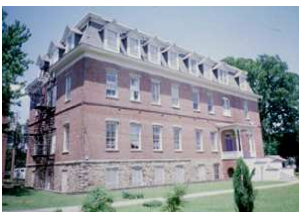
Main Building, Arkansas Baptist College 1600 South Doctor Martin Luther King, Junior Drive 1893 school for black theologians Listed on 4/30/1976