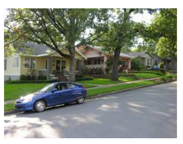
Stifft Station Historic District

African Americans were not financially able to access the larger facilities downtown, such as the Robinson Auditorium. They were, however, able to hold their services and conventions at the GLRQSC. Radio Station KOKY even hosted a live remote broadcast every Sunday morning from this site, where gospel groups would come to be heard across the airwaves. It is significant for its associations with the religious, social and cultural life of Little Rock's African-American community.