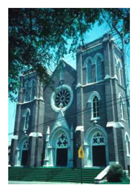
St. Edward's Church