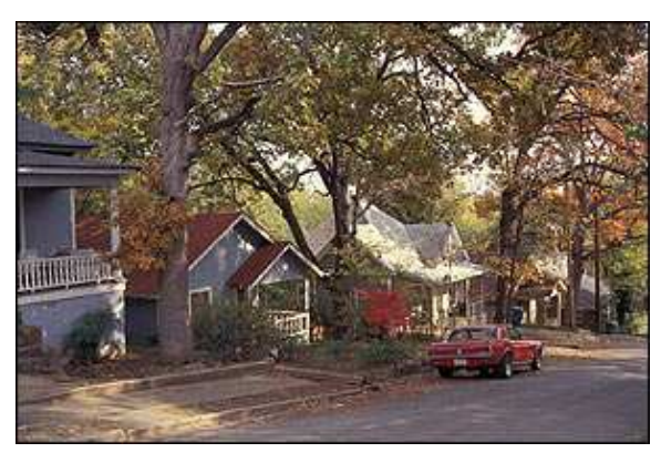
Capitol View Neighborhood Historic District

roughly bordered by Riverview Drive, Schiller Street, West 7th Street, and Woodrow Street