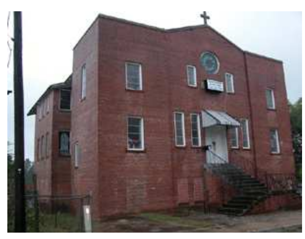
St. Peter's Rock Baptist Church

1901 Gothic design by architect Charles L. Thompson Listed on 12/22/1982