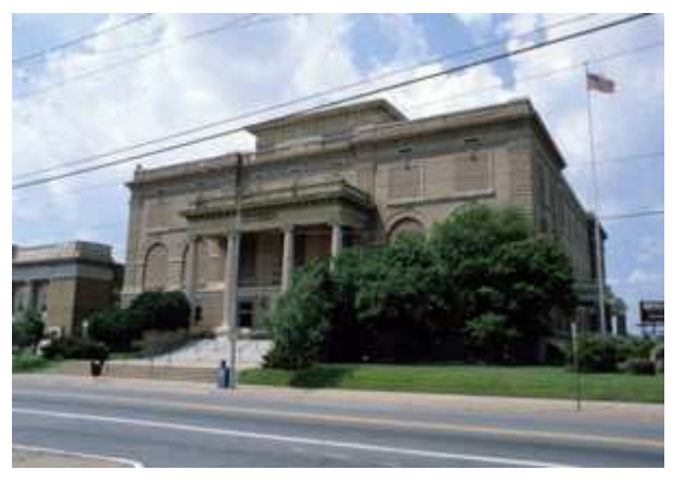
Little Rock City Hall