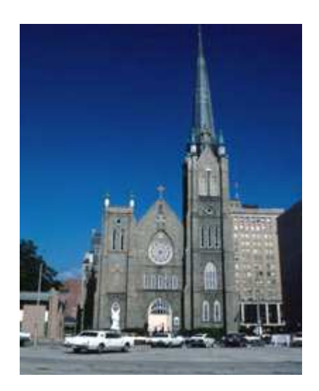
St. Andrew's Catholic Cathedral

The 21 contributing properties within the South Scott Street Historic District comprise a unique ensemble of historic residential architecture within the city of Little Rock. The South Scott Street Historic District stands as the largest and most well-preserved group of modest, middle-class and working-class residences from the late nineteenth and early twentieth centuries in the city. Its assortment of relatively simple house plans, adorned with detailing from the Queen Anne Revival, Colonial Revival and Craftsman idioms, is representative of the majority of middle class neighborhoods across Little Rock during the period.