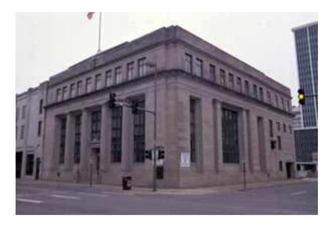
Federal Reserve Bank Building