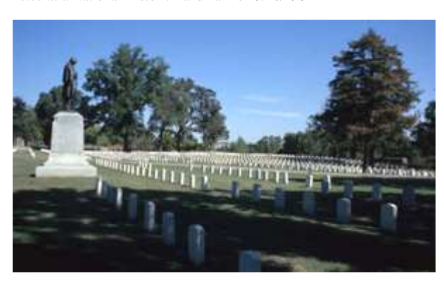
Little Rock National Cemetery

Listed in National Register of Historic Places on 8/19/1977 Listed as a National Historic Landmark on 5/20/1982