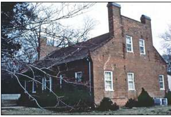
Ten Mile House

1916\,head quarters of black fraternal group, features ballroom Listed on 4/29/1982