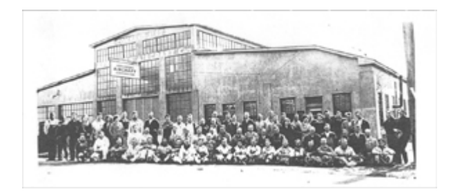
Climber Motor Car Factory, Unit A (1928 photo)