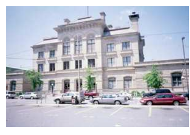
Old Post Office and Custom House