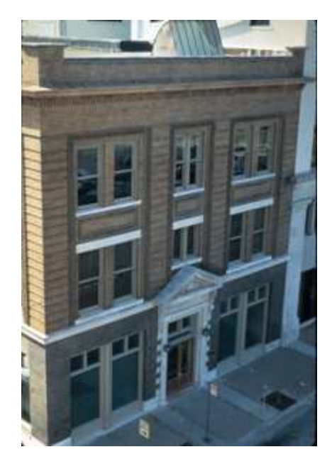
Peoples Building and Loan Building

Listed in National Register of Historic Places on 12/3/1969. Listed as a National Historic Landmark on 12/9/1997.