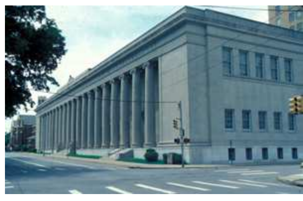
Albert Pike Memorial Temple 700-724 South Scott Street 1924 Classical Revival building Listed on 11/13/1986