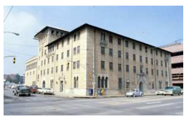
Little Rock YMCA 524 South Broadway 1928 Spanish Revival design Listed on 7/22/1979