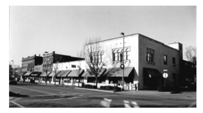
South Main Street Commercial Historic District

South Main Street from 12th to 17th Street